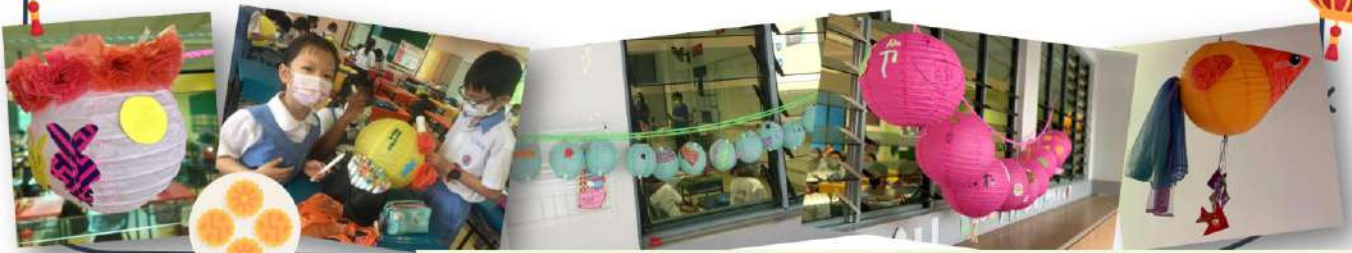
Students' beautiful lanterns on display—marvels of creativity, artistry and personal craftsmanship

Our students tried their hand at designing their own unique lanterns using upcycled materials on 20 September 2021. They were given round lanterns to work with as they resembled the full moon which represented our collective wish to be reunited with our loved ones during these difficult times, both locally and overseas. The hour-long Lantern Design Activity was live-streamed via Zoom and students shared about their design ideas with their schoolmates during the live Gallery Walk.