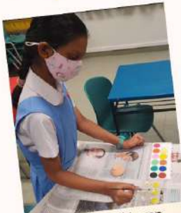
Primary 3 Oil Lamp Painting