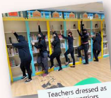
Teachers dressed as Ninja warriors

Embracing the affordances of technology, we launched ELLF 2021 at the end of Term 3 with Breakfast with Brallier , where students had a chance to Zoom with New York Times bestselling author – Max Brallier. He shared about his work, his writing process and gave tips on how to write better action sequences based on two budding Primary 6 writers' work.