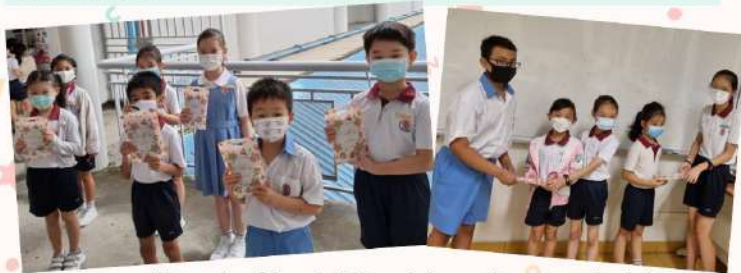
All geared up, Primary 1 & Primary 2 class monitors representing their classes to present the cards to Primary 6 seniors

Our Primary 3 to Primary 6 students wrote gratitude cards for our support staff, thanking them for their dedication in caring for them and ensuring that the school is clean, safe and conducive for learning.