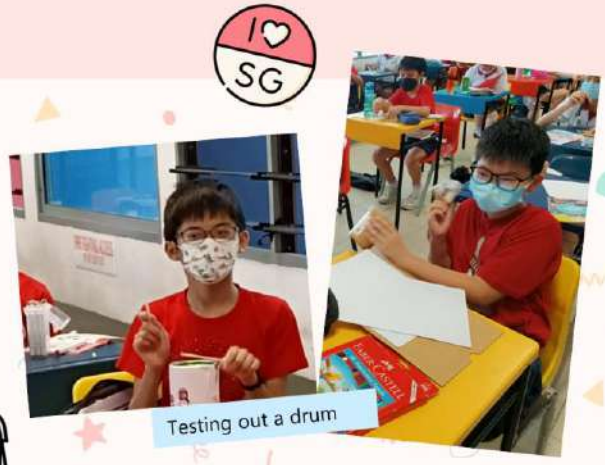
Testing out a drum