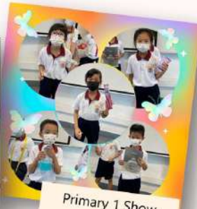
Primary 1 Show and Tell