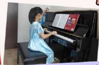
Kemingnites putting up online performances as part of the e-concert for teachers to enjoy on the actual day