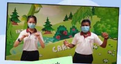
Curated videos of craft work and simple home workouts