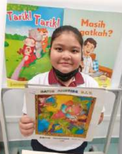
Primary 6 Batik Painting