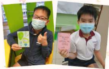
Delighted Primary 6 seniors on receiving the motivational cards

It was really heart warming to receive handwritten notes to affirm and to encourage us, despite the lower primary students not really knowing us that well. I appreciate the kind thoughts!