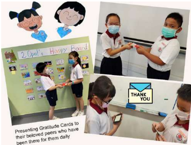
Presenting Gratitude Cards to their beloved peers who have been there for them daily