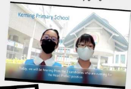
Head Prefect Rally going online!

Kemingnites were very eager to cast their votes after listening to the candidates' inspiring speeches!