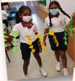
Primary 2 Thoranam Making