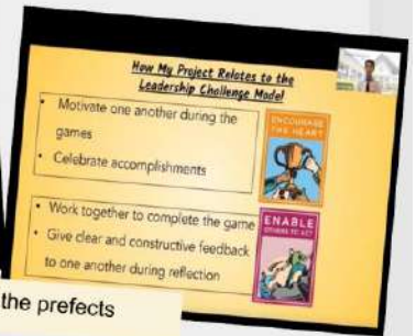
Projects done by the prefects