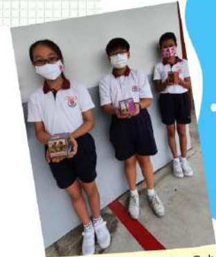
Students with their 'Conversation Cubes', a token from National Gallery Singapore