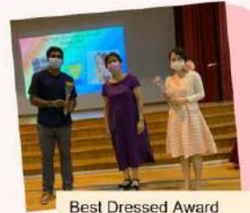
Best Dressed Award