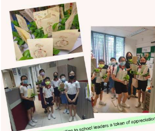
Student leaders presenting to school leaders a token of appreciation