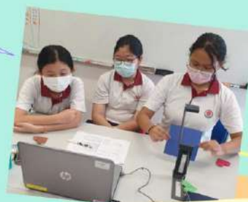
Our Primary 6 presenters all ready in action!