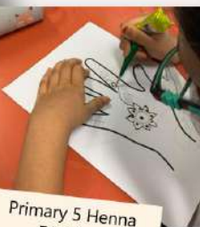
Primary 5 Henna Drawing