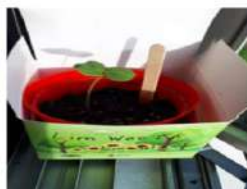
Growing and growing by the day