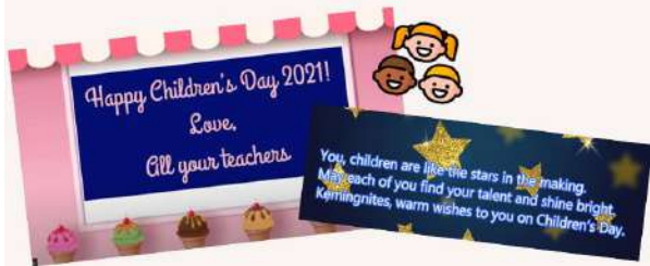
Fabulous E-concert put up by all Keming teachers

May all Kemingnites learn well and continue to explore their talents. Happy Children's Day!