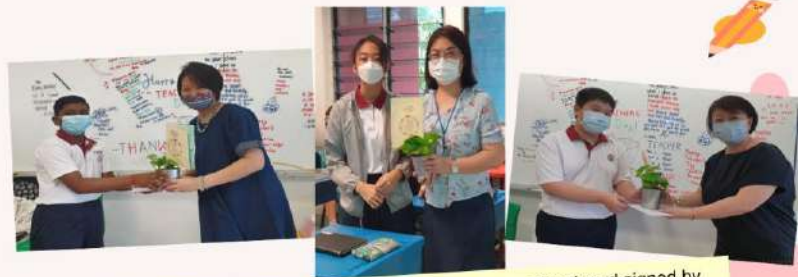
Students presenting a pot of money plant and a personalised card signed by students with their well-wishes on it