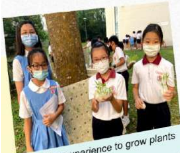
A rewarding experience to grow plants from seeds

Students recorded the weight of their harvests. The edible harvest was consumed while the spoils were used as soil compost.