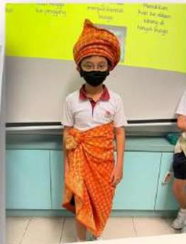
Primary 4 Busana Warisan Kita