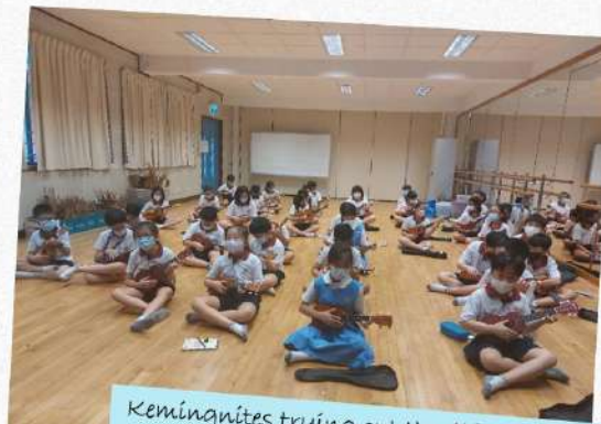
Kemingnites trying out the different strumming techniques on their ukuleles

Primary 4 students had their Ukulele enrichment programme, where they learnt to play a song using the 4 chords. They had the opportunity to play some local folk songs like “Chan Mali Chan” and “Singapore Town” on their ukuleles.