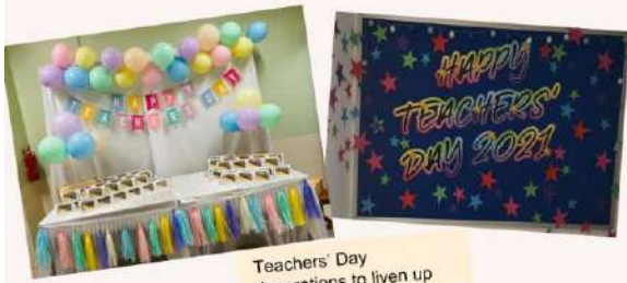
Teachers' Day decorations to liven up the mood