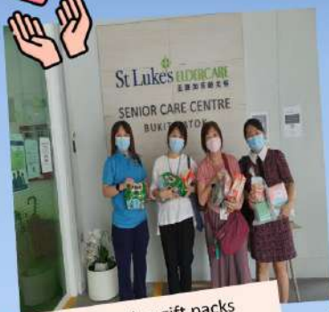
Staff contributing gift packs comprising of face masks, hand sanitisers, packets of oats and Milo to seniors at St Luke's ElderCare

The school celebrated Grandparents' Day from 15 November to 21 November 2021. An e-concert consisting of curated videos on craft work, baking and simple home workouts done by our students and parent volunteers was shared with the seniors of St. Luke's ElderCare (SLEC) and Bukit Batok Care Home. Our Kemingnites were also encouraged to participate in the activities as well as to view the e-concert with their grandparents via SLS over the weekend.