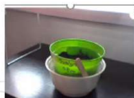
I can't wait for it to grow into an adult plant!