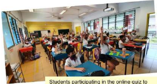
Students participating in the online quiz to test themselves on what they have learnt during the Art Appreciation session