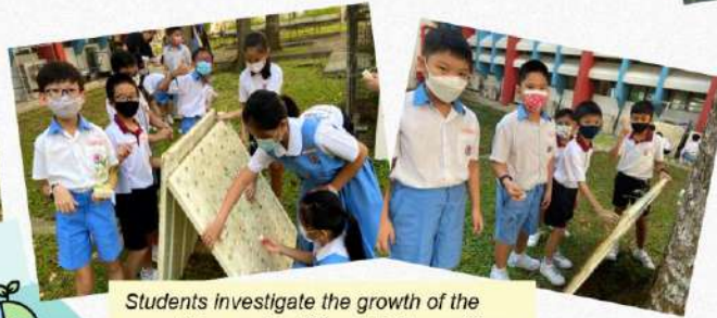
Students investigate the growth of the vegetables under different light conditions