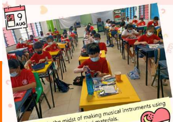
Students in the midst of making musical instruments using recycled materials.

The theme "Together Our Singapore Spirit" called for us to unite, be resilient and emerge stronger as a nation. Our National Day songs never fail to evoke emotions and pride in us as Singaporeans. This year, students made musical instruments using recycled materials to strum along as the songs were played. It certainly brought the celebration to a high note.