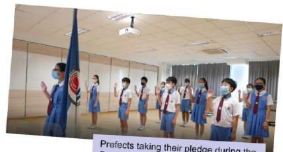
Prefects taking their pledge during the Prefect Investiture