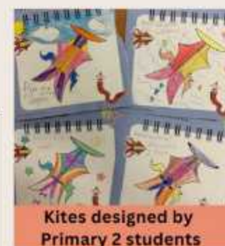
Kites designed by Primary 2 students