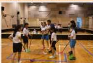
Keming-Nangang friendly floorball match