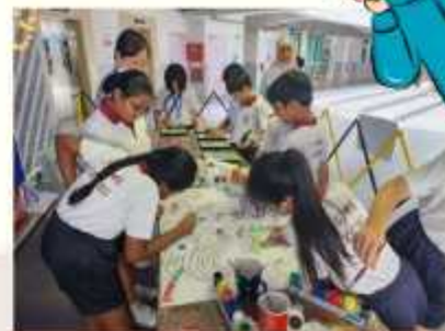
Community batik painting at Batik Butik

Kemingnites were engaged with community batik painting, interactive puzzles and an Instagram-worthy photo booth!