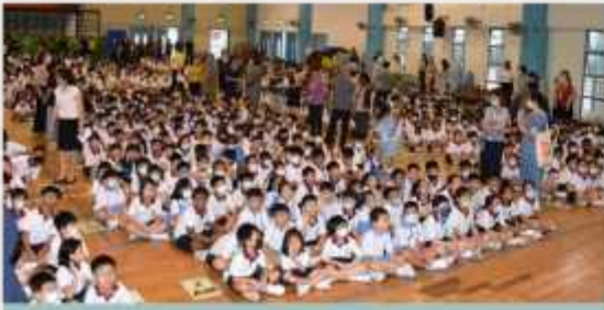
Assembling in the hall due to the rain

This year's theme is "Together We Keep Singapore Strong". Total Defence Day serves as a reminder to us that each one of us plays an important role to secure our sovereignty and success for the years to come.