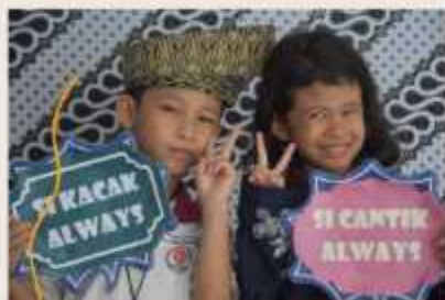
Poses and smiles in Malay traditional costume at the cultural photo booth