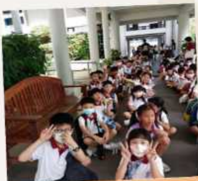
Excited students anticipating the play as they wait to board the bus