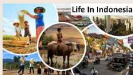
Life In Indonesia