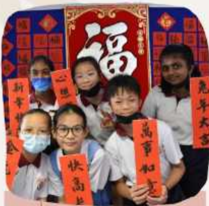
Crafting CNY wishes