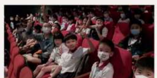
Eagerly waiting for the play to begin