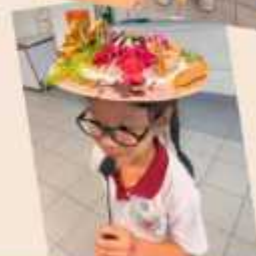
Kudos to the students for DIY-ing and dressing up as their favourite book character

Blind date with a book - Borrowing a book that was wrapped up