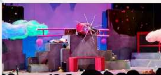
A close-up view of the props on stage