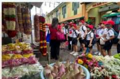
Our students partnered with Nangang students and embarked on a learning journey to Little India

The Internationalisation Programme aims to support students in their global outreach by providing them an opportunity to learn and interact with friends around the world. This year, the Primary 5 students worked collectively to put together hosting plans for Taipei Municipal Nangang Elementary School, Taiwan and Dulwich College (Junior), Singapore. This opportunity allows our students to develop their 21 st century competencies of global awareness and cross-cultural skills and sensitivities that are essential in today's world.