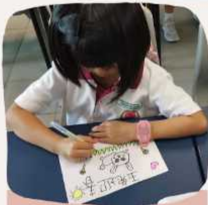
Creating a CNY card!