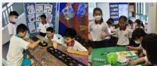
Cultural Exposure (Nangang students experiencing Malay traditional game, Congkak and Batik Painting with the guidance of our Primary 5 students)