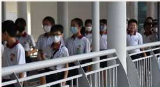
Students responding to the fire drill

Kemingnites also responded to a fire drill in a timely and calm manner. Way to go, Total Defence Supporters!