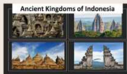
Ancient Kingdoms of Indonesia