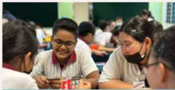
Primary 6 students learnt through play with the SG Unite card game