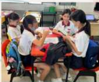
Role-playing with interview script

The Primary 6 students learnt important communication skills such as planning for and responding to interview questions as well as using appropriate body language, clear articulation and making eye contact during their interviews.