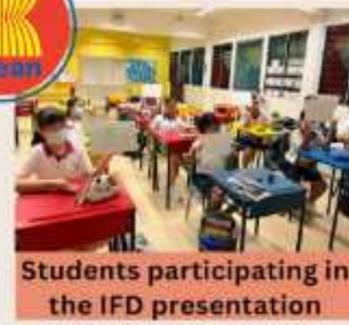
Students participating in the IFD presentation