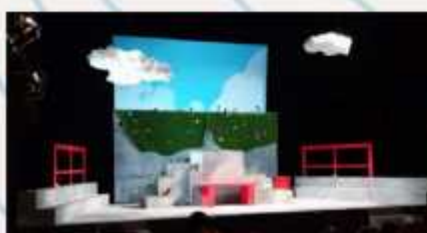
Intricately designed stage and props at the theatre