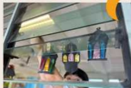
Putting up art pieces for display after a Hari Raya lantern-making session during Art lesson