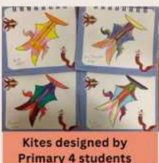
Kites designed by Primary 4 students