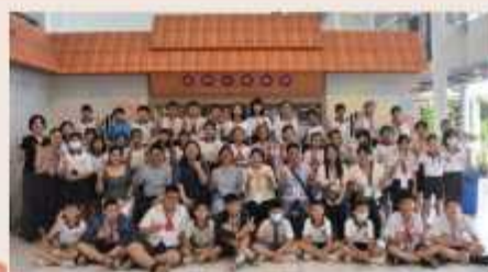
Group photo with the students and staff of Nangang Elementary School