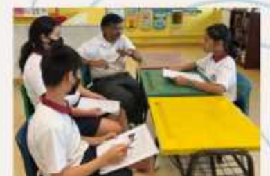
Trainer giving feedback to the students