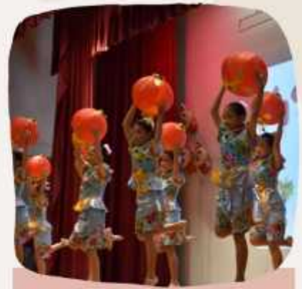
Enjoying the spring in the dancers' steps!

This year, Kemingnites hopped into the CNY festive spirit through a myriad of activities such as Chinese calligraphy, paper cutting, rabbit origami and cultural sharing by teachers.