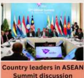
Country leaders in ASEAN Summit discussion

In line with Form Teacher Guidance Period (FTGP), students learnt to appreciate the importance of developing good friendship with neighbouring countries to ensure food security. They were tasked to design kites and reflect on what else they would like to know about the Indonesian culture and what they would like to experience if they could visit the country.