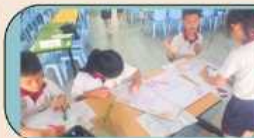
Students showed their support by writing words of encouragement to the performers on an A3-sized card

There was a huge turnout where classmates & friends showed support to the performers!