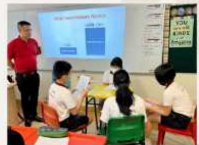
Practice makes perfect!

It is heartening to see our Keming seniors conducting themselves like self-assured young adults!