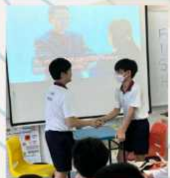
Making a good first impression