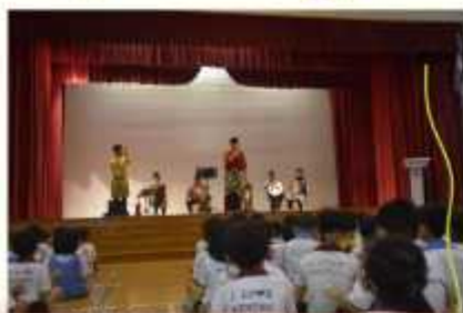
NADI musicians leading Kemingnites in an interactive segment

This year, Hari Raya Aidilfitri @ Keming had the privilege of having 'Rentak Akar', an interactive, one-of-a-kind live traditional music performances by NADI!