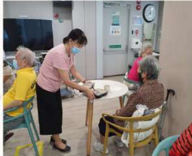
Meals Sponsored for Senior Citizens @ St Luke's Eldercare (Bukit Batok)