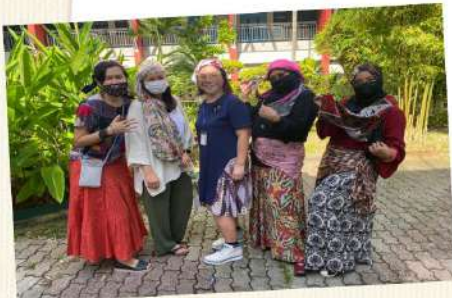
Characters from the book 'The Family Under the Bridge' come alive during Character Dress-Up Day!

Using the text The Family Under the Bridge written by Natalie Savage Carlson, values such as empathy for the less fortunate in the society, inclusiveness and social responsibility were woven into the lessons. Students were made aware of the people in need around them - the less fortunate, the elderly and the homeless. Realising that age should not be a barrier in giving, students connected with the elderly in our community by creating well-wishes cards and multi-sensory stimulation kits. These creations were given to the elderly residing in St Luke's Hospital and Bukit Batok Care Home.