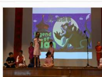
Drama Nian performed with Dulwich College