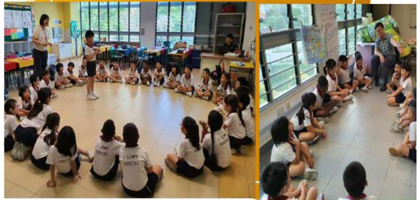
Students bonding with one another during Circle Time (photos were taken before Circuit Breaker)

It is a time when students share their thoughts and listen to their peers, understanding one another better and hence, strengthening peer relationship to cultivate a positive classroom culture.