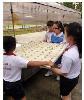
Primary 4 students ready to plant their seedlings into the hydroponics sheds (photos were taken before Circuit Breaker)