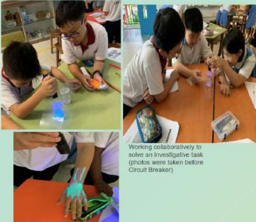
Working collaboratively to solve an investigative task (photos were taken before Circuit Breaker)

The students were excited to listen and learn from each other and they respected the opinions of their peers. They considered all perspectives before making a decision. In the process, the students learnt resilience and harmony. They were also inspired to explore deeper, applying the skills that they had learnt.