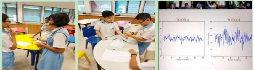
Students working together during the situational interview task (photos were taken before Circuit Breaker)

With Safety Management Measures in place since April, students in the programme demonstrated their love for learning when they diligently attended sessions on Zoom, and even tried out coding to generate graphs from large environmental database. We are proud of their efforts!