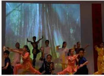
CNY Concert Wushu Performance