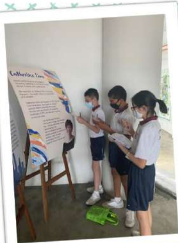
Students learning more about our local authors

The theme for this year was 'Going Local'! During the last two weeks of Term 3, students from Primary 1 to Primary 5 levels were engaged in various online and offline interactive activities that helped students better appreciate local literature and foster a love for the English language. Some of the in-class activities included Teatime with Local Authors and Poetry Time . During recess, the students went to various booths parked outside the library to learn more about several of the local authors. The annual event culminated in Character Dress-Up Day on Wednesday (2 Sept) where both students and teachers had fun dressing up as their favourite local storybook characters!