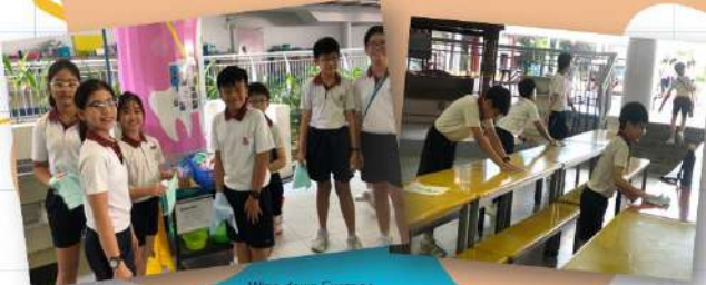
Wipe-down Exercise (photos were taken before Circuit Breaker)

The students had a taste of war-time staple food when they tried eating sweet potatoes during recess. In all, this year's Total Defence Day was memorable!