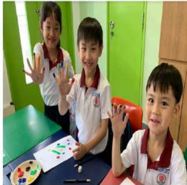
Our vibrant and fun lessons (photos were taken before Circuit Breaker)