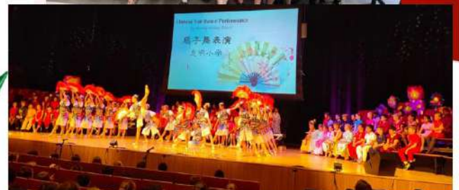
Keming Chinese Dance performance at Dulwich College's CNY Celebration (photos were taken before Circuit Breaker)