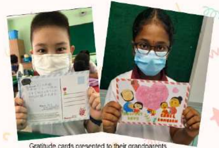
Gratitude cards presented to their grandparents

Selected student leaders and staff also did an e-sharing to teach the elderly simple craftwork and exercises. Nothing brought us greater joy than to see the warm, happy smiles on the faces of the senior citizens when they viewed the e-performances and received the contributions from the Keming family.