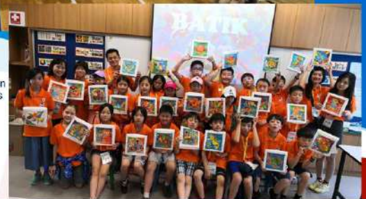
Exposure to Southeast Asian Art Form (Nangang students & staff showcasing their artwork)