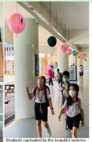
Students captivated by the beautiful lanterns