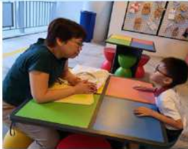
Keming Chat sessions with their form teachers (photos were taken before Circuit Breaker)

Following the conversations, form teachers provide guidance to tackle the issues surfaced.