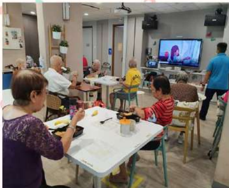
e-Performance by Staff, Students & Parent Volunteers Screened for the Senior Citizens @ St Luke's Eldercare (Bukit Batok)