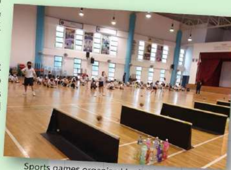
Sports games organised by PE department