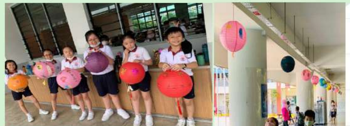
Lantern Design Competition

In our CCE lessons, interesting facts and stories depicting the culture of Mid-Autumn festival were shared with our students. Each level was engaged in different craftwork activities. The students also designed lanterns which were hung in the school campus to reflect the joy of the festivity, blooming with love and harmony.