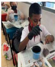
Students planting the seeds in pots.