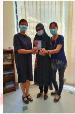
Staff VIA Contributions from Staff for the Bukit Batok Home for the Aged