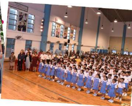
Keming Family united as one!