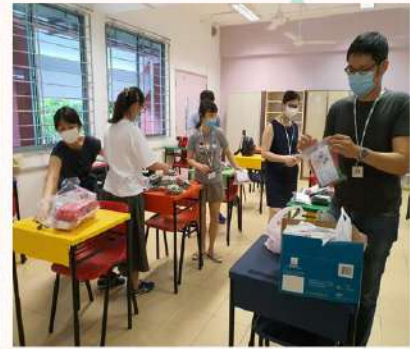
Packing of essential items (staff together with PVs) for St Luke's Eldercare (Bukit Batok) – Purchased with the contributions from staff