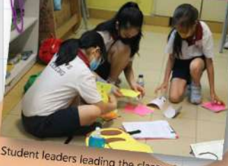
Student leaders leading the classes in class games