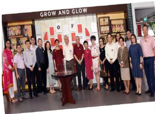
Unveiling of the 85th Anniversary Feature Wall