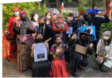
Teachers joining in the fun! Can you spot Sherlock Sam and his trusty robot, Watson?