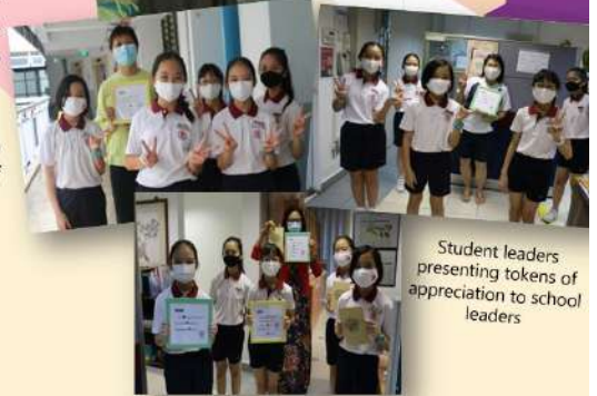
Student leaders presenting tokens of appreciation to school leaders