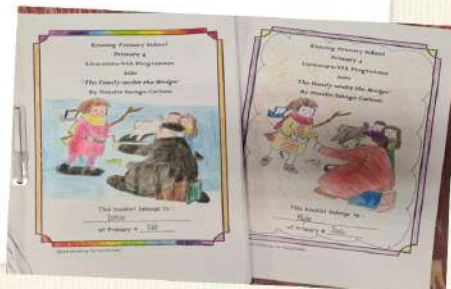
Students learned how to analyse the plot, characters and deepen their understanding of literary devices based on the given text.