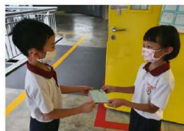
Appreciation notes for their peers