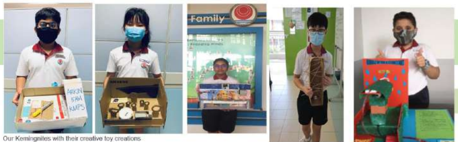
Our Kemingnites with their creative toy creations

Our Kemingnites displayed resilience and continued to work on their projects, despite not being able to interact face to face with the teachers and had to navigate their way with only the SLS packages to scaffold their work. Through this journey of discovery and problem solving, our Kemingnites have definitely let their creativity flow to bring their amazing ideas to life!