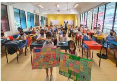
Our P6 teachers and students touched and grateful by the encouragement from the rest of the school

Finally, in Term 4 on Children's Day, the students wrote appreciation notes for their peers and the school's support staff.