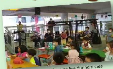
Teachers performing live during recess

The highlight of the day was the e-concert where all teachers came together to put up performances for our Kemingnites. Our students were in high spirits when the e-concert ended with a joyous cheer.