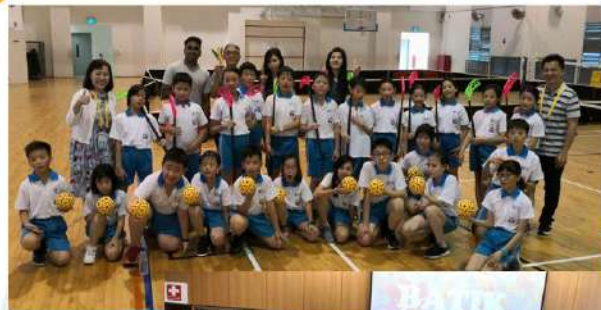
Physical Fitness through Team Play (Nangang students & staff showcasing their agility)

This year, we also partnered Taipei Municipal Nangang Elementary School to enrich the learning of our students. Such partnerships expose our students to international relationship building, allowing them to gain a better understanding of Southeast Asian countries and developing in them the 21st century competencies of global awareness and cross-cultural skills and sensitivities that are essential in today's world.