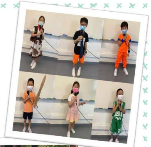
Students dressing up as their favourite characters during Character Dress-Up Day!