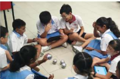
Students learning and discussing how to do the code (photos were taken before Circuit Breaker)

In Semester 1, the Code for Fun Programme was conducted for all our Primary 5 students.