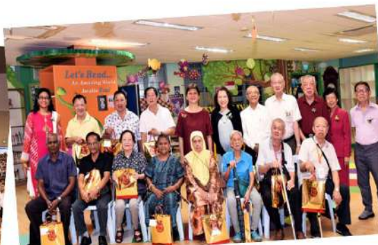
School leaders and GOH with seniors from Bukit Batok Active Aging Club (photos were taken before Circuit Breaker)

2020 is a special year for the Keming Family as Keming Primary turns 85. The launch of our 85 th anniversary was indeed a significant event as members of our School Advisory committee, Alumni Association and Parent Support Group graced this special occasion and unveiled our Acts of LOVE Feature Wall.